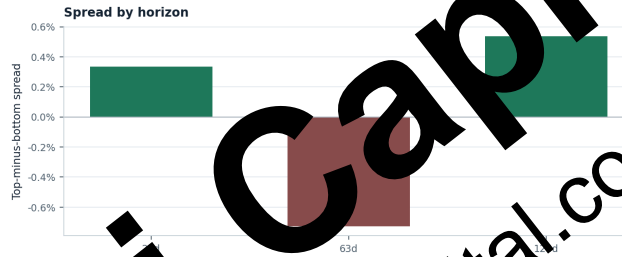
Figure 2. Top-minus-bottom spread across test horizons under the same comparison setup.